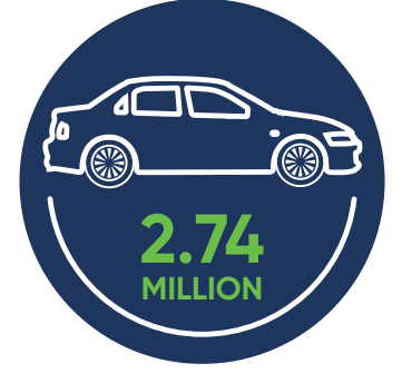
people were estimated to have been injured on roadways in 2019.<sup>2</sup>