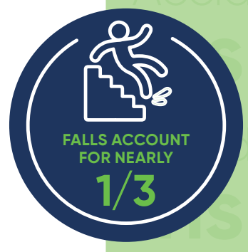
of all non-fatal injuries in the U.S.<sup>3</sup>